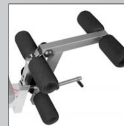
Optional F611 Leg Extensions / Curl

Bodycraft™ is a division of Recreation Supply, Inc. P.O. Box 181 Sunbury, OH 43074 Phone 800-990-5556 Fax:740-965-2449 www.bodycraft.com